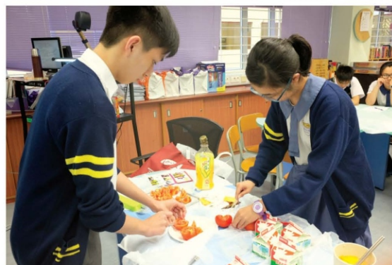
Workshop presented by Ms Sum