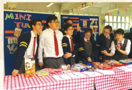
Students could buy tasty snacks at the Mini Tuckshop