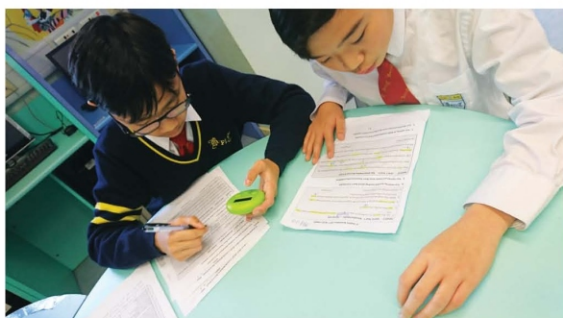
Students participating in Readathon Round 2