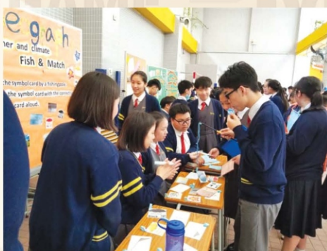
Students playing Fish & Match at the Geography game booth