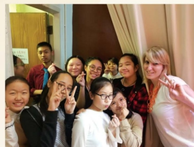
S1 cast members having fun backstage while waiting for their scene