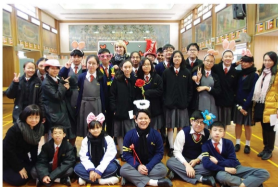
English Ambassadors at the Valentine's Day Carnival