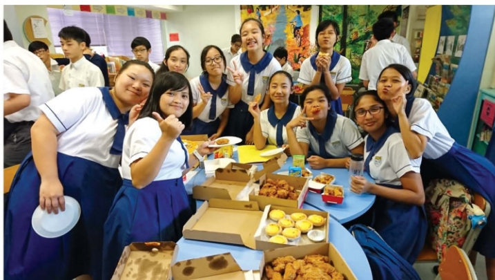
English Ambassadors at the party