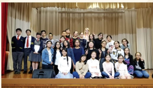
The cast and crew of 'City of Dreams'