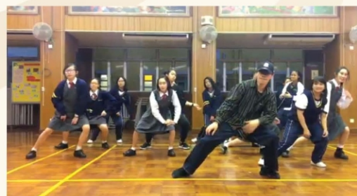
The dance crew rehearsing with the choreographer