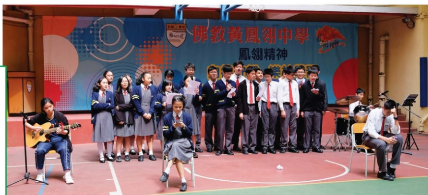
S2 English Show Time held in March