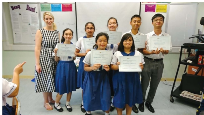
English All-Rounder Award