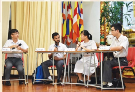
The four finalists having a group discussion on stage