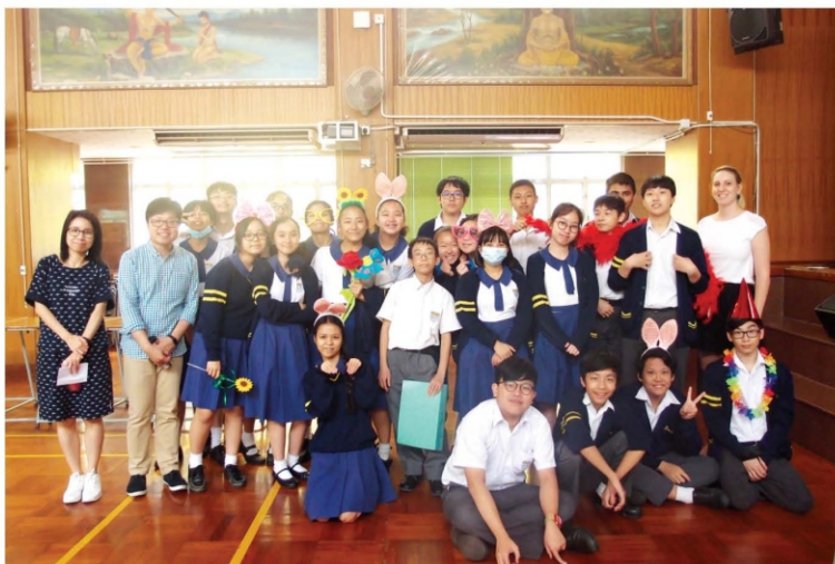
English Ambassadors at the Spring Carnival