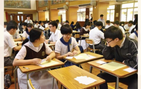
Students having group discussions in the hall