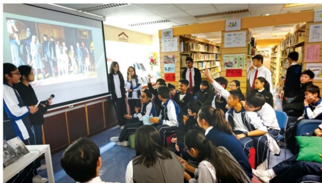
S2 students sharing a novel